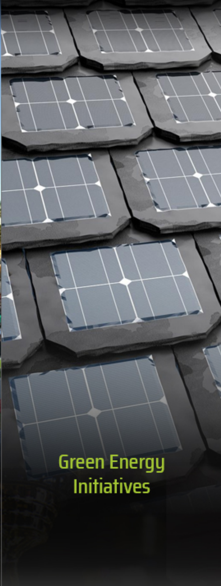
Green Energy Initiatives