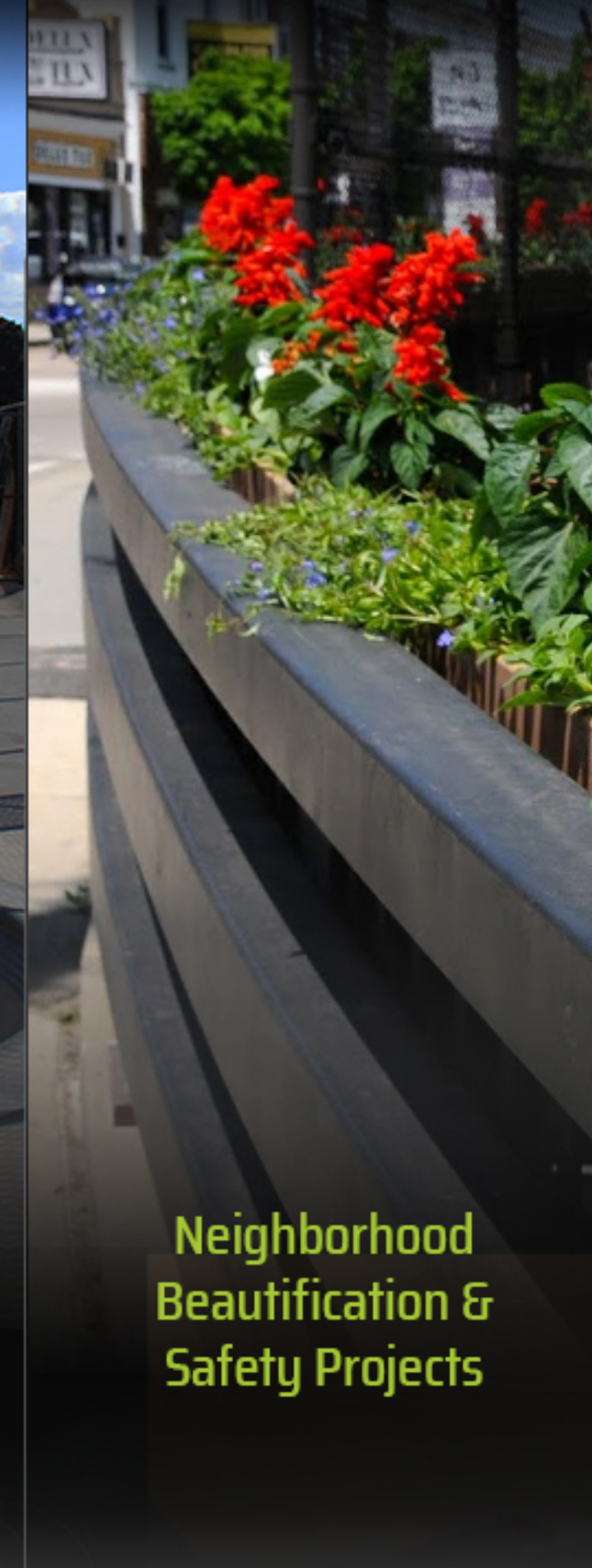
Neighborhood Beautification & Safety Projects