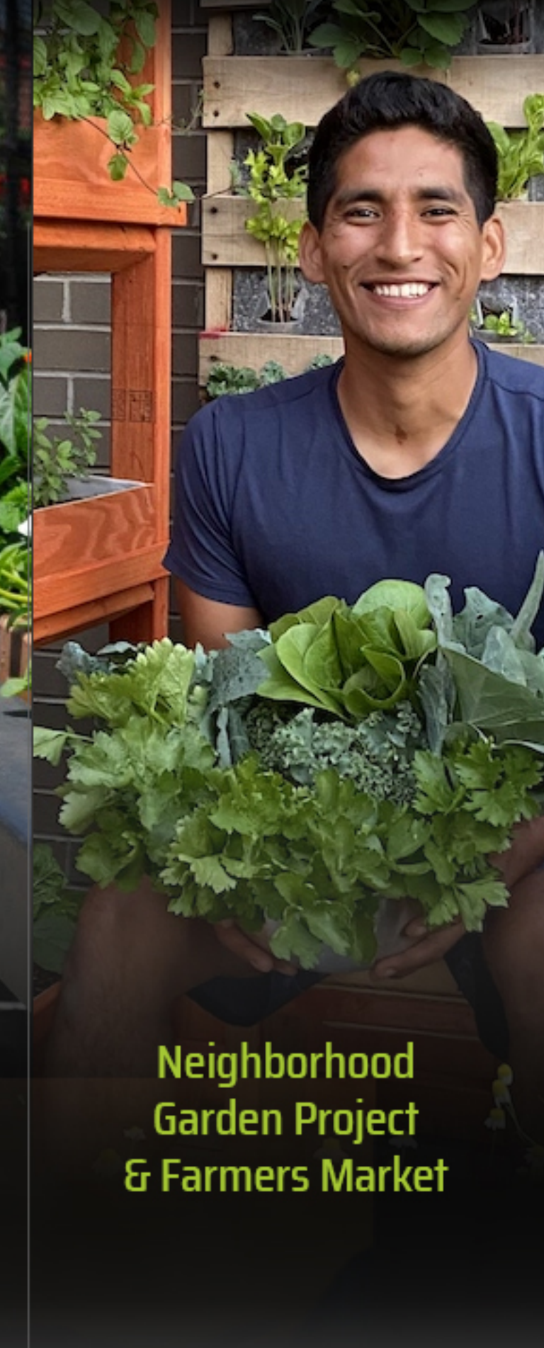
Neighborhood Garden Project & Farmers Market