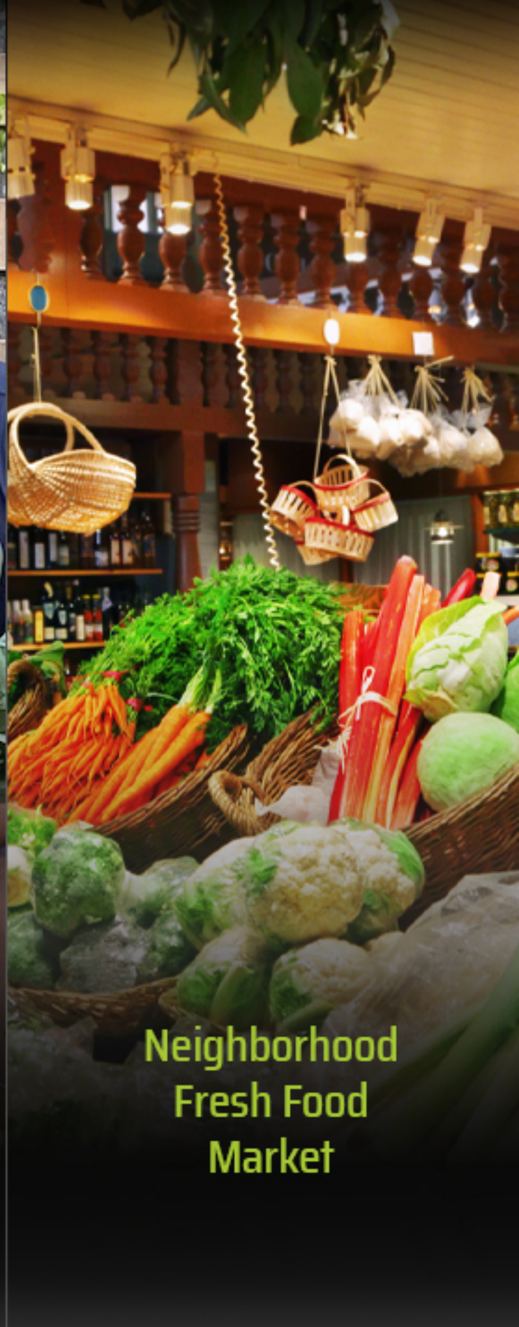
Neighborhood Fresh Food Market