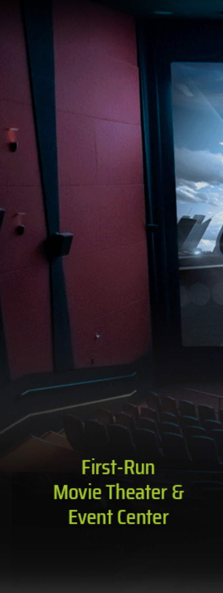
First-Run Movie Theater & Event Center