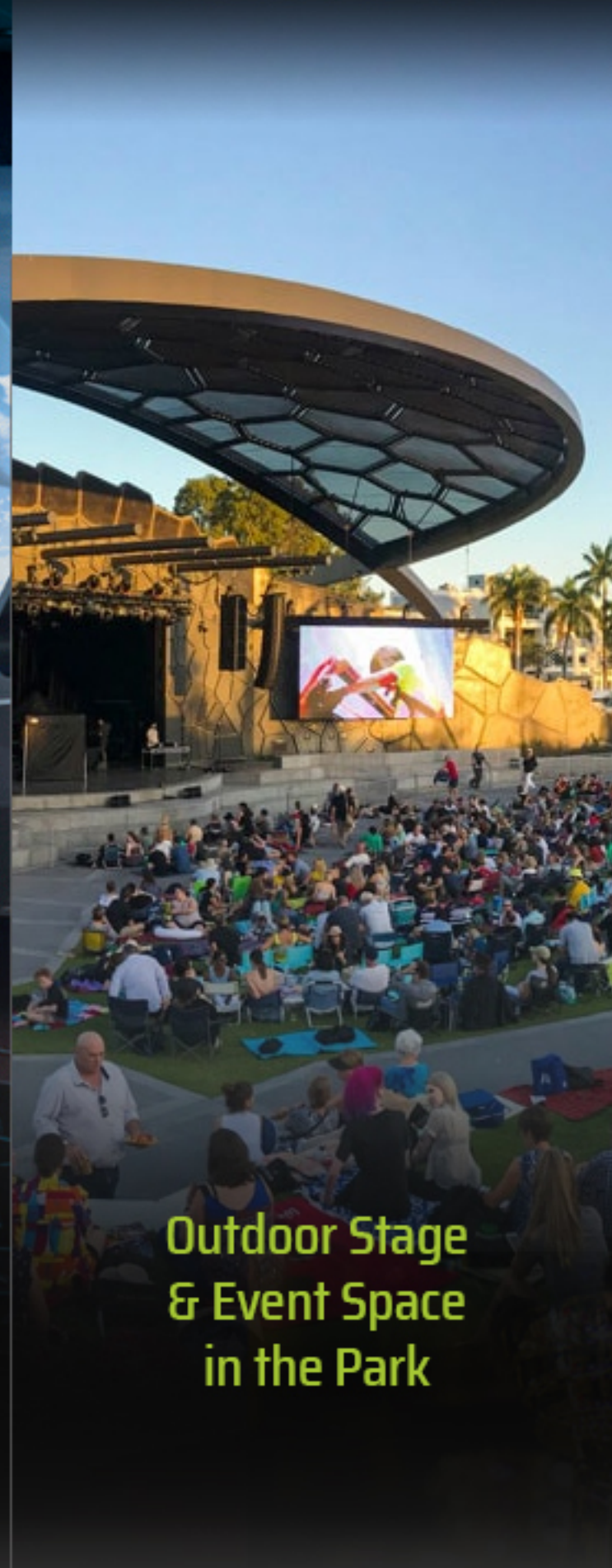
Outdoor Stage & Event Space in the Park